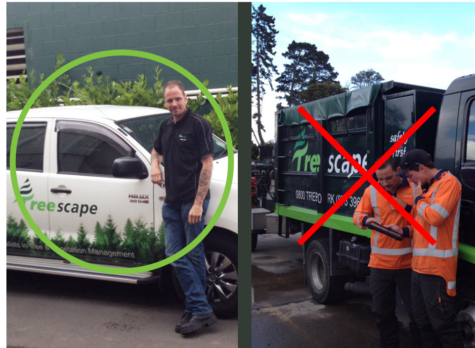
Don't do this