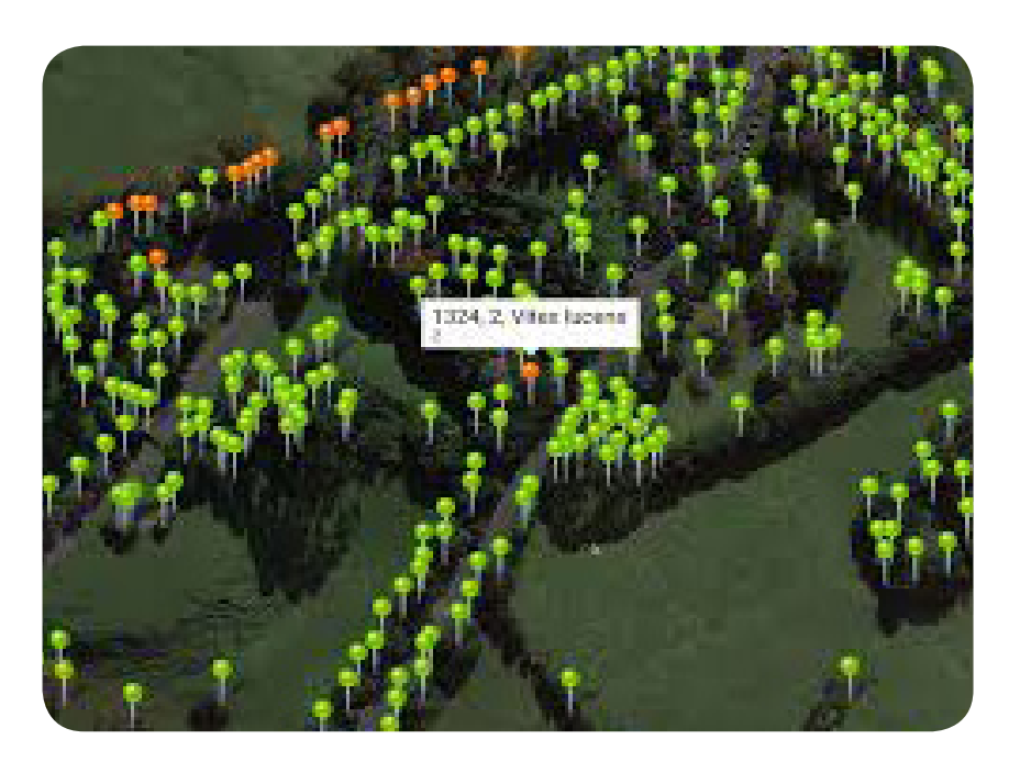
Innovative technology to solve any issues and highlight project risks quickly, efficiently and accurately.